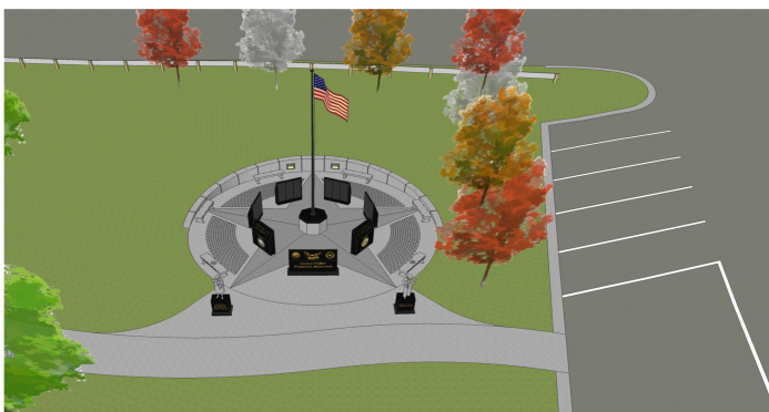
Castro Valley Veteran's Memorial

*If able, please also supply us with a mini-biography of the named veteran.